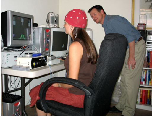
HANDS ON LEGS